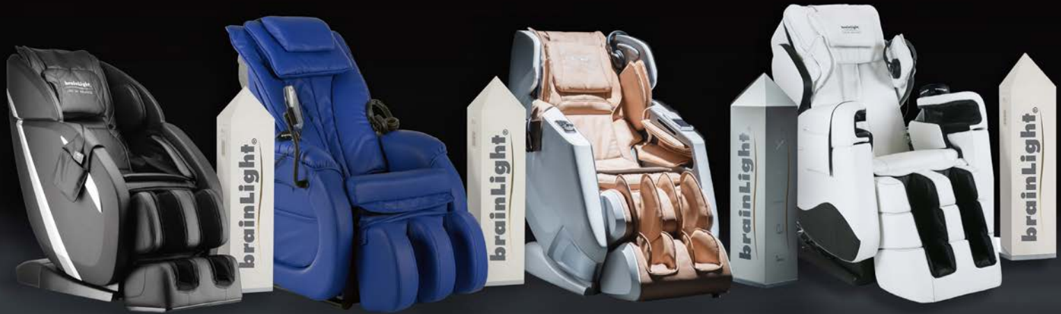
brainLight relaxTower with brainLight-Shiatsu-Massage-Chairs

Relaxation technology Made in Germany! Repeatedly awarded for: Innovation, high quality, design, functionality and ergonomics. Awarded by the PLUS X AWARD panel as "Deep Relaxation System of the Year" and "Product of the Year" for 2012/13, 2013/14, 2014/15, 2016/17 and 2019 and most recently again in 2021 and 2023.